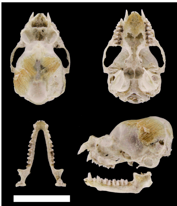
Figure 2. Skull (lateral, dorsal, and ventral profiles) and mandible (lateral and dorsal profiles) of Diclidurus scutatus (MZUSP 35681) from Machadinho D'Oeste, Rondônia, Brazil. Scale bar = 10 mm. This figure is in color in the electronic version.