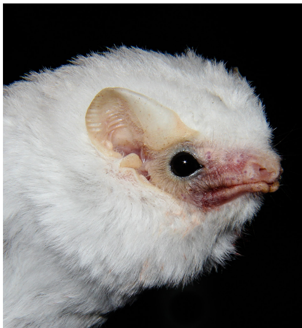
Figure 1. Specimen of Diclidurus scutatus (MZUSP 35681) from Machadinho D'Oeste, Rondônia, Brazil. This figure is in color in the electronic version.

With this record, D. scutatus has been recorded in 20 locations in eight South American countries, in Brazil,